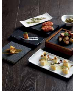
DINING IN THE SKY CLOCKWISE FROM TOP — Red velvet banquettes dominate the indoor area of the bar — The signature Tapas dishes — The walk-in Vodka Room 0 degree

Helmed by a Spanish Chef Victor Taborda, the range of finger-food and Tapas will have something to please everyone. From salads and dips such as guacamole with pico de gallo and corn chips, to 5 types of gourmet pizzas. Among the best-sellers are 'Broken Fried Eggs with Spanish Sausage and Foam Potato which came in for special mention by many diners. The 'Fried Pork Ribs, Potatoes with Aioli, Kimuchi and chilli sauce' and 'Stewed Beef on Toasted Ciabatta Bread with Gratin Aioli' were also highly praised by many.